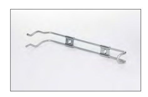
DI1009 CAR BRACKET