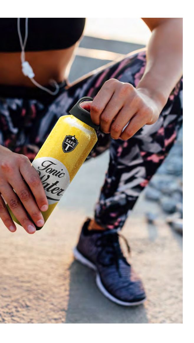
Bottles 750ml Elegant lightweight and durable.