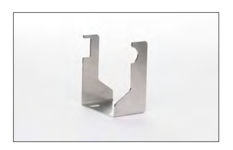
DI1002 WALL BRACKET