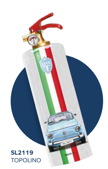
SAFE-T – Reinventing the Fire Extinguisher with Great Style!